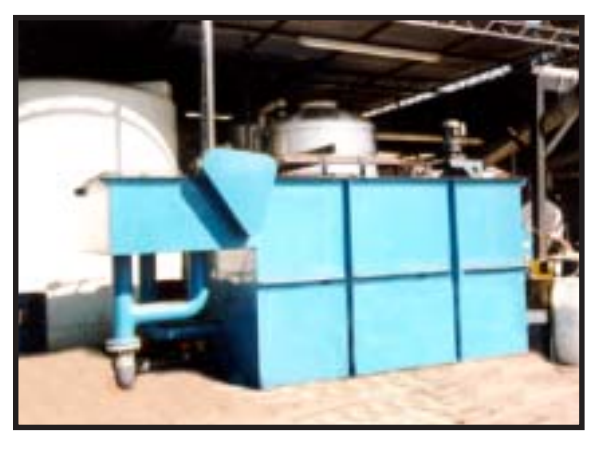
CAF-25 Installed in Industrial Laundry.