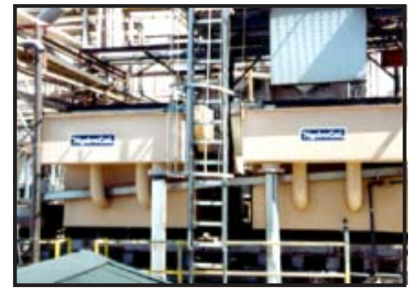
Twin CAF systems installed in an olive plant.