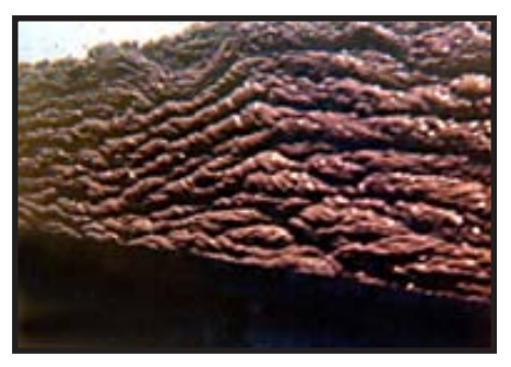
Removal of fats, oils and greases, and suspended solids

The aerated ponds were producing a foul odor & the chloride content of the aquifer was increasing to a level endangering the water quality.