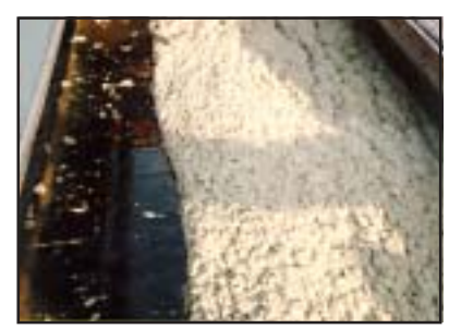
Sludge being discharged into a screw conveyor.