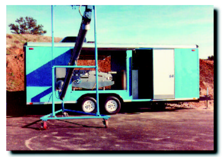
1.5 meter, stainless steel, trailer mounted belt press with auxiliary equipment

compact, efficient and easy to operate. The HydroCal Belt Presses use a single, self-adjusting belt that carries the sludge up an inclined gravity drainage zone, followed by a thorough dewatering as the sludge passes through uniquely designed neoprene covered rollers. HydroCal's 1.0 Meter Stainless Steel Belt Press has the capacity to handle a flow of 30 gpm. The 1.5 Meter Stainless Steel Belt Press has a 50 gpm flow capacity.