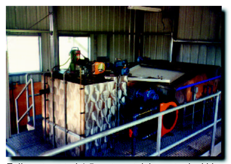
Fully automated 1.5 meter, stainless steel, skid mounted belt press

Digested primary sludge • Aluminum sludge • Primary activated sludge • Domestic activated sludge • Primary screening • Industrial activated sludge • High rate filtration sludge • Agriculture sludge • Humus & digested humus sludge • Cattle slurry • Pig slurry • Chicken manure • Dairy Industry sludge • Paper Pulp Industry sludge • Food Industry sludge • Brewing Industry sludge • Meat Industry sludge • Pharmaceutical Industry sludge • Chemical Industry sludge • Please call for verification of applications not listed above.