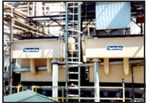
Twin CAF systems installed in an olive plant.