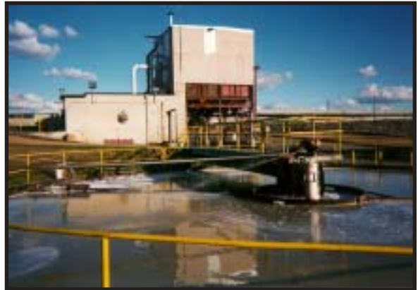
The CAF, housed in the building behind the clarifier, was installed to improve the clarifiers performance.

After the CAF installation, both the odor and land application problems were solved. The HydroCal CAF unit successfully treats the recycle stream from the de-watering equipment, achieving consistently high reductions in total suspended solids, BOD and oil & grease levels. The elimination of high strength recycle streams from the process enabled the treatment system to function as originally designed.