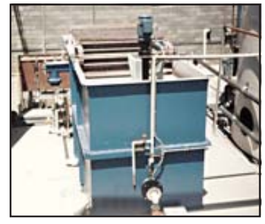
Model CAF-25 installed in a tannery.